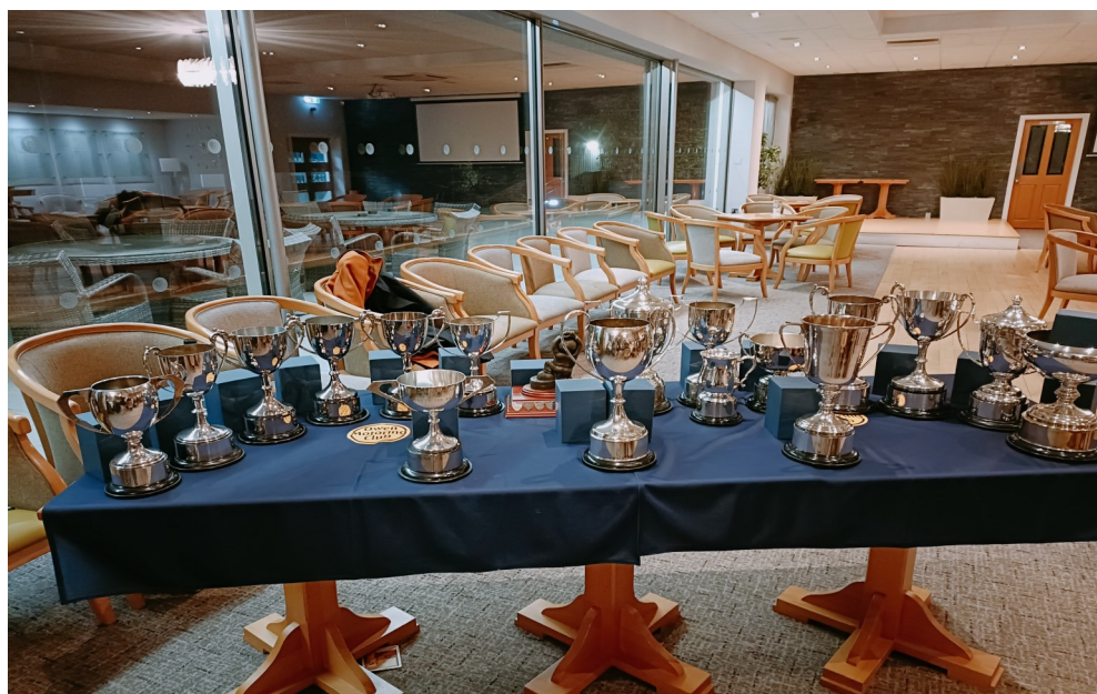
A spectacular collection, just some of the OMC annual awards trophies.