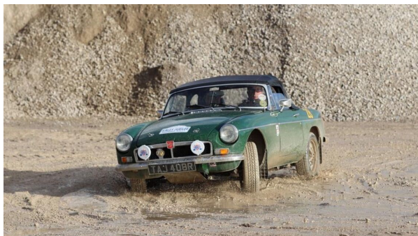
Above and Right Dean Forest & Melvyn Cox on the north Yorks Classic Rally

After this it was into the final five tests on farmland, very slippery and smelly around heaps of manure. The final few miles of transport section took us to the finish and final control in the market square in Easingwold. The villagers had turned out in force to welcome the rally with a party atmosphere around the square. It's good and encouraging to see the public embracing an event in this way.