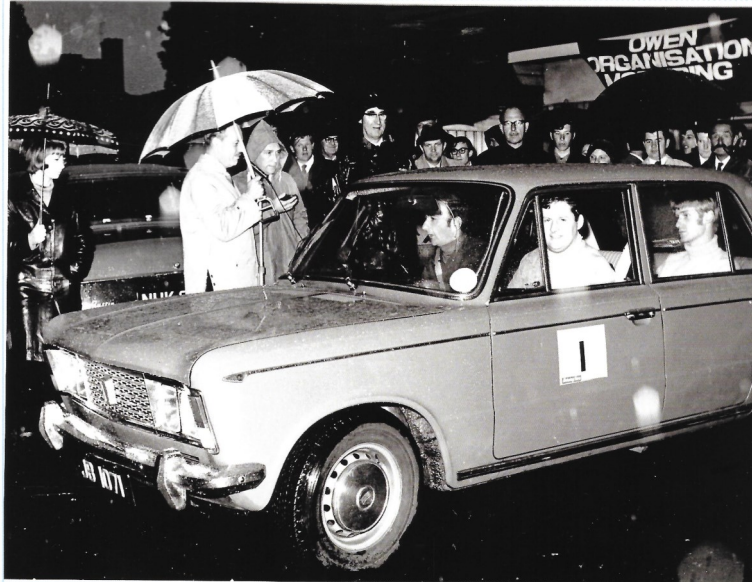
Start 1968 AGBO Rally