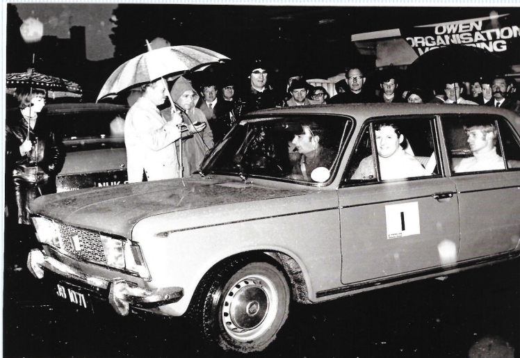
Start 1968 AGBO Rally