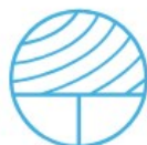
Trials and Cross Country